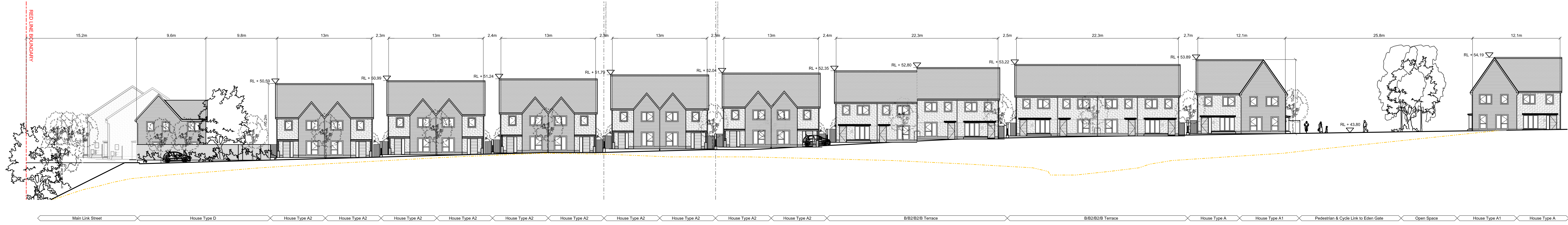
Elevation 03 Scale:1:200