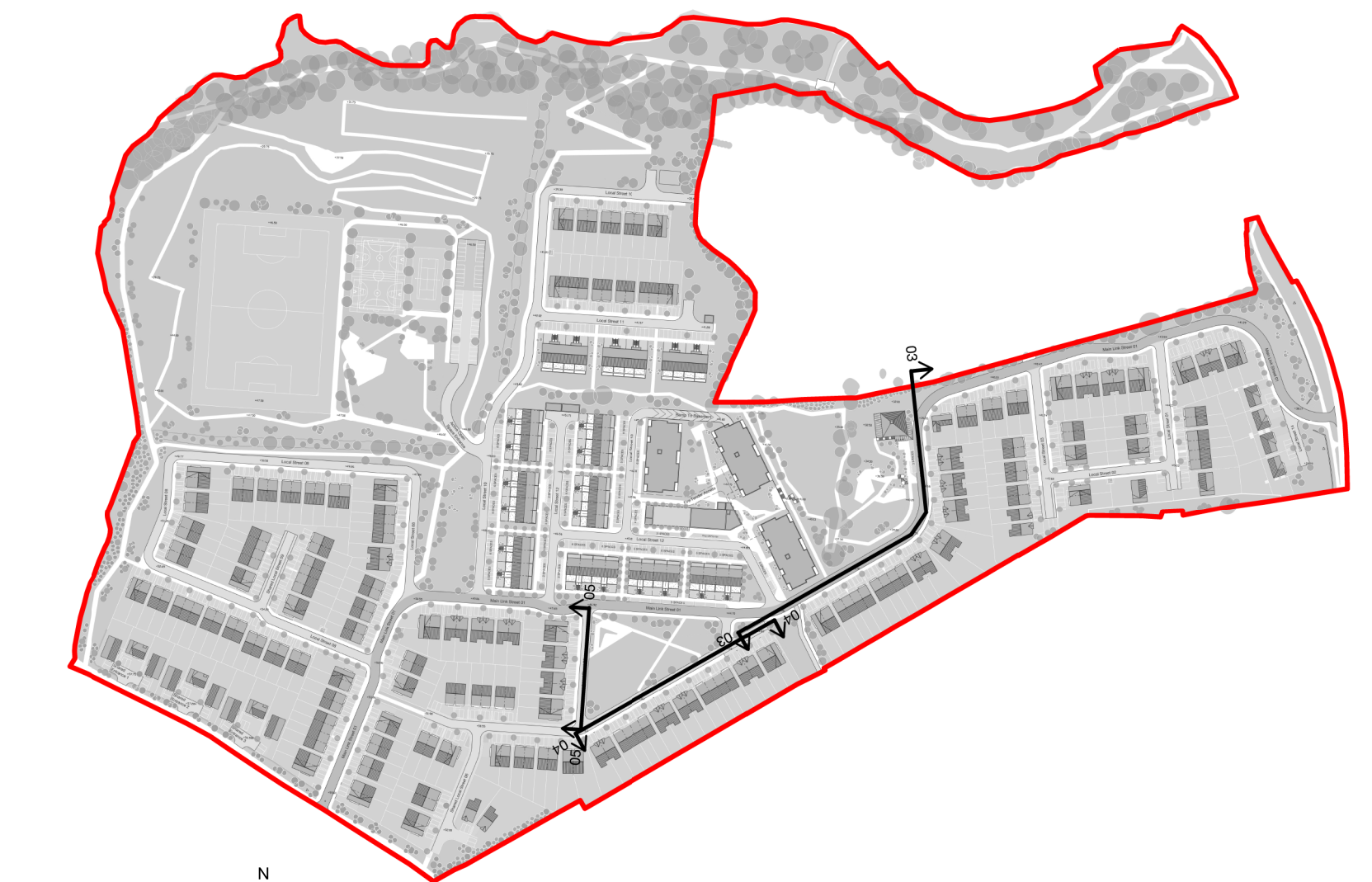
Key Plan NTS