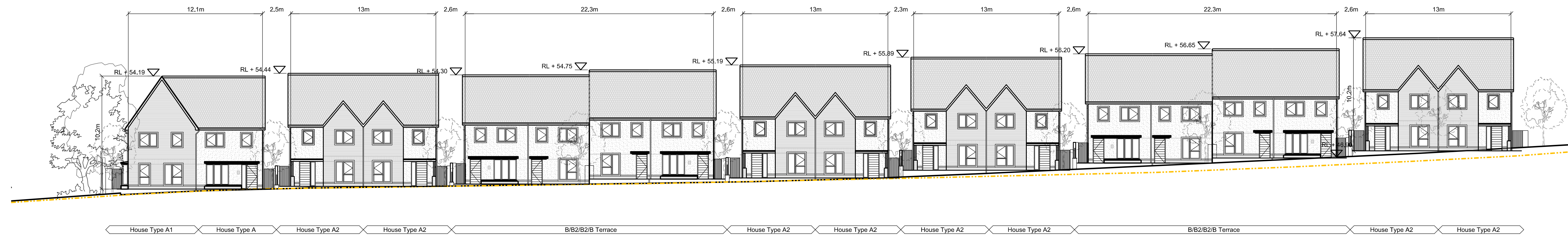
Elevation 04 Scale:1:200